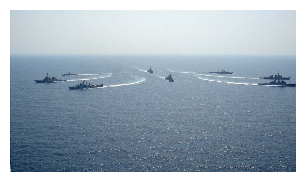
Figure 1. In this handout photograph provided by the Indian navy, Indian and US naval ships are seen during a joint India-US naval exercise, Malabar 07-1, off the coast of Okinawa, Japan, Wednesday, 11 April 2007. The Indian navy has embarked on a series of exercises with navies from the US, Japan, Russia, China, the Philippines, Vietnam and New Zealand, according to news reports. (AP Photo/Indian Navy HO).

With respect to irregular security challenges in the region, American nuclear non-proliferation efforts would continue unabated. Ideally, regional security cooperation would extend to nuclear matters in a manner that addresses the concerns of countries such as South Africa, India and Indonesia, who have previously resisted joining such efforts as the Proliferation Security Initiative. In so far as nuclear proliferation by states in the Indian Ocean region is driven by security concerns vis-à-vis the United States, a restrained US posture could reduce some of that anxiety. With respect to terrorism, the capacity-building focus of this strategic approach could extend to the counter-terrorism realm, and to states beyond the democratic major powers, wherever the contacts, local